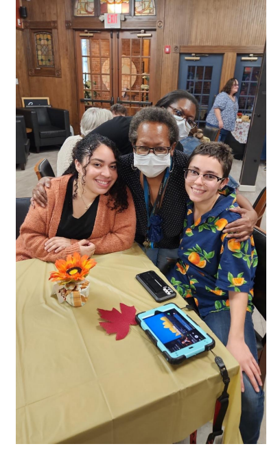
Staff were asked to bring in a dish that represented their culture and enjoyed dining on a variety of flavors and cuisines from around the world, including Italian, Puerto Rican, Caribbean, Polish, American and more!